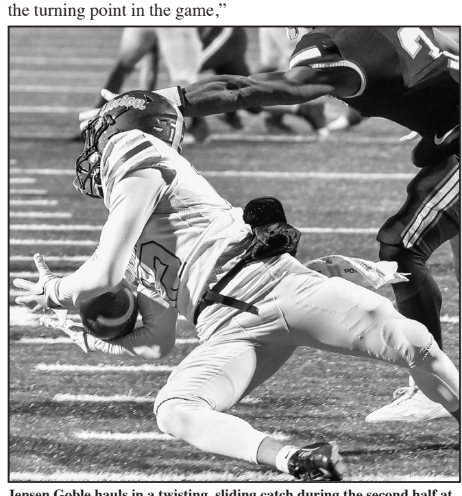
weren't getting many posses- Fellowship. The senior finished with 13 grabs.

No defensive stats were "For me, that [drive] was available at Monday's deadline.